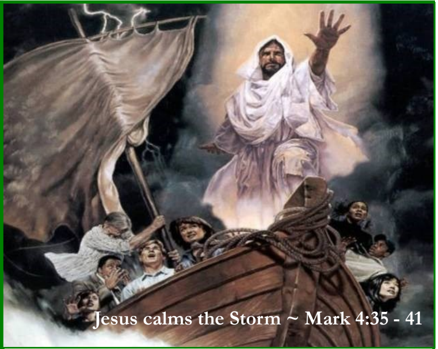
Jesus calms the Storm ~ Mark 4:35 - 41